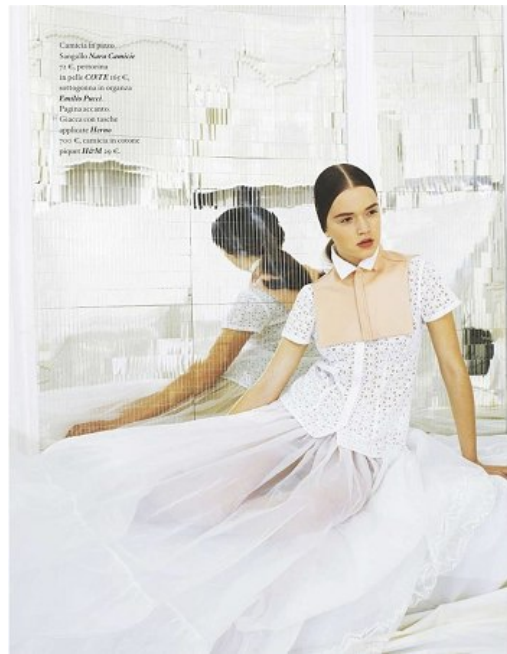
Canaglia in pizzo Sargola Nova Conville 75 €, permutina in pizzo COZZE 114 €, sottopigiama in organza Fendiha Pirelli Pigiama cotone Giacca con tasche agghiozo Home 700 €, camicia in cotone paper HGM 104 €.