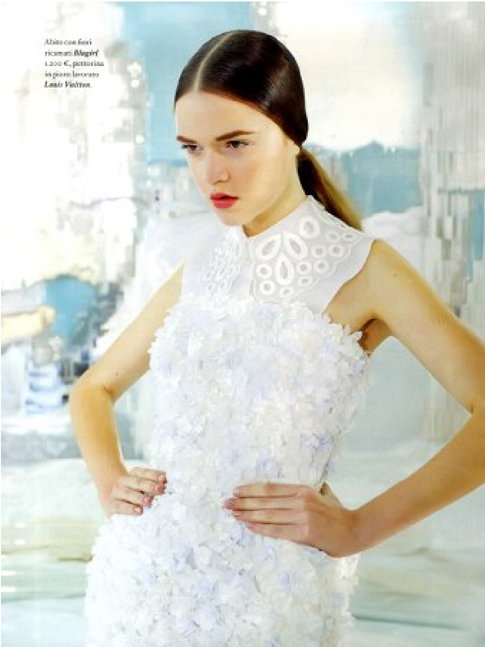
Abito con fiori ricamati Blaghi 1.200 €, permutina in pizzo lavorata Louis Vuitton.